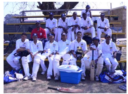
TOP: MOZAMBIQUE – BOTTOM: INVITATION