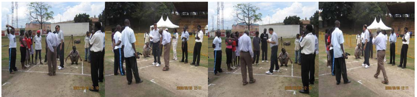
Practical sessions at Lugogo Cricket Oval.