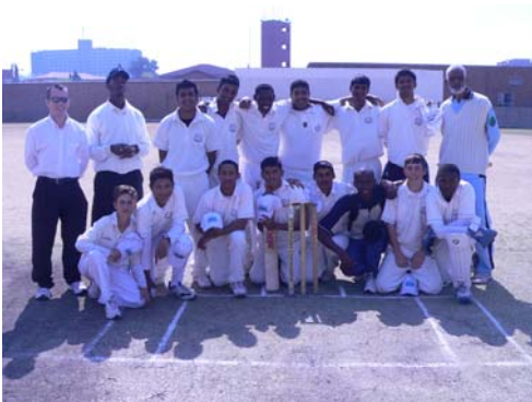
TOP: BOTSWANA – BOTTOM: NAMIBIA

Benoni, South Africa hosted the ICC-Africa Central & Southern Region U17 Tournament from the 30 th of August – 02 nd of September 2008. The event saw 5 African countries (divided into 2 pools according to strength) participating in this tournament including a local invitation team. The competing nations were Botswana, Lesotho, Mozambique, Namibia, Zambia and the 6 th team being the Invitation Team from the Eastern Junior Club Cricket U17 side. The final was contested between Namibia and Zambia with Namibia gaining a 14 run victory over Zambia.