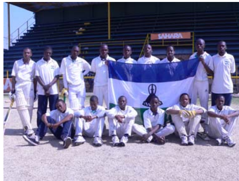
TOP: LESOTHO – BOTTOM: ZAMBIA