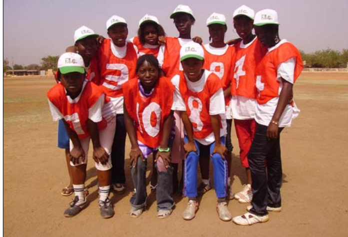
Les All Stars: FeMaCrik 2009