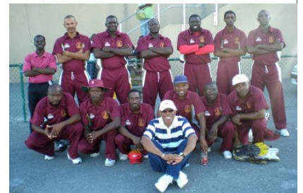
Sports Minister & Jam Turk