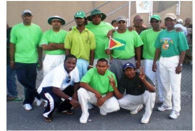
Guyana Jaguars winning

Final score Police 257 for 4 off 30 overs and Seven Stars in reply -231 all out off 27.5 overs. The Police won by 26 runs.