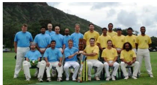
Master Batters (Blue), Cobras (Yellow)

The plan is to expand the Hawaii Premier League into an international competition, in a tournament structure beginning in May 2010.